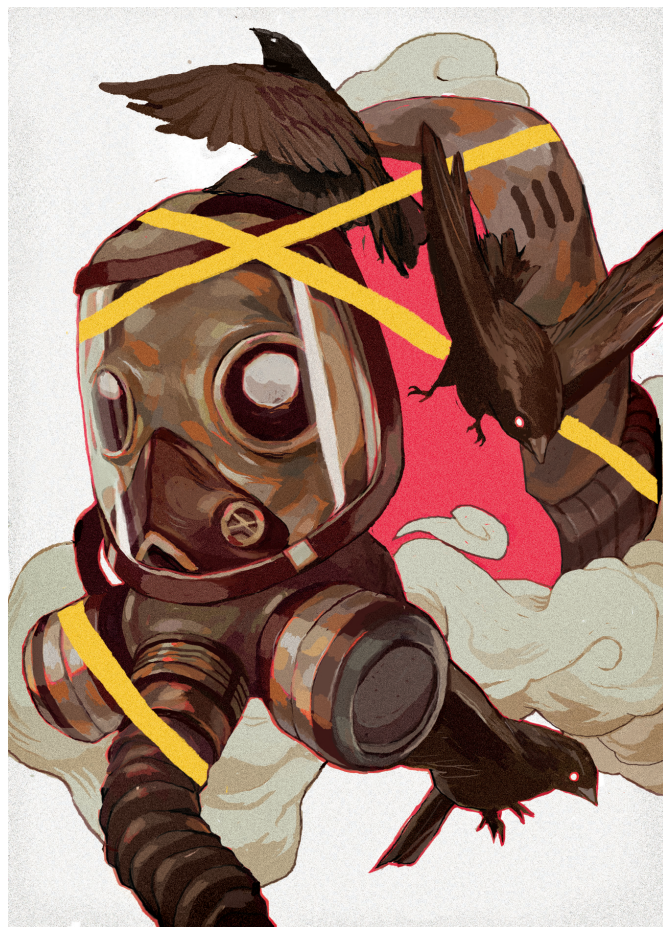
How likely is the virus to escape the laboratory?